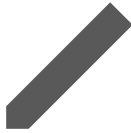
Black felt-tip markers