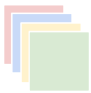
4 colors of Post-it stacks